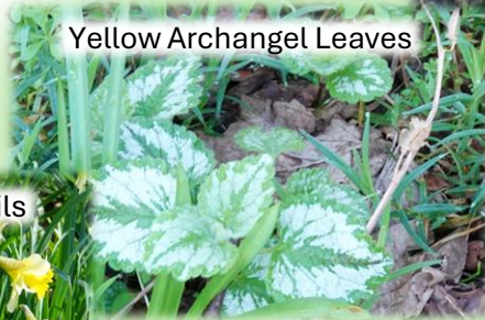
Yellow Archangel Leaves