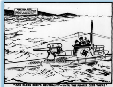
"GOD BLESS EIRE'S NEUTRALITY-UNTIL THE FUHRER GETS THERE"

NICHOLAS MONTSERRAT, THE CRUEL SEA (1951)